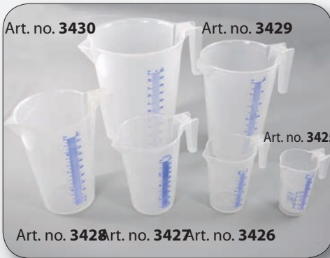
Art. no. 3425-3426-3427-3428-3429-3430

Graduated, transparent measure, in oil and acid resistant polyethylene, stackable and unbreakable. Temperature range: -10° C - +120°C.