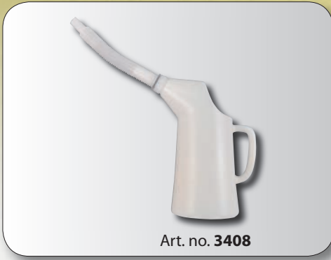
Art. no. 3408

Graduated measure, in high density polyethylene, with funnel type outlet and flexible extension.