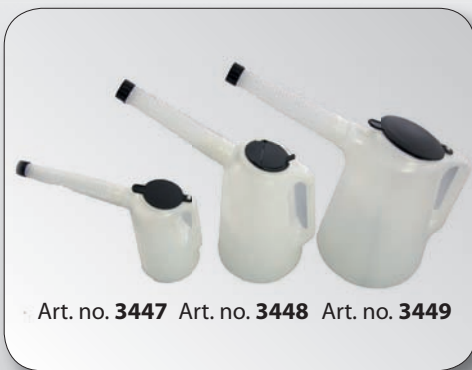
Art. no. 3447 - 3448 - 3449

Graduated measure, in high density polyethylene, with funnel type outlet, flexible extension with cap, protection cover. Suitable for the use with oil, fuel, antifreeze, windshield washer fluid, break fluid, battery fluid.