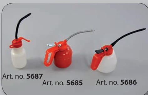
Art. no. 5685

Pump action oiler, container in painted steel, capacity 500 ml, with flexible outlet.